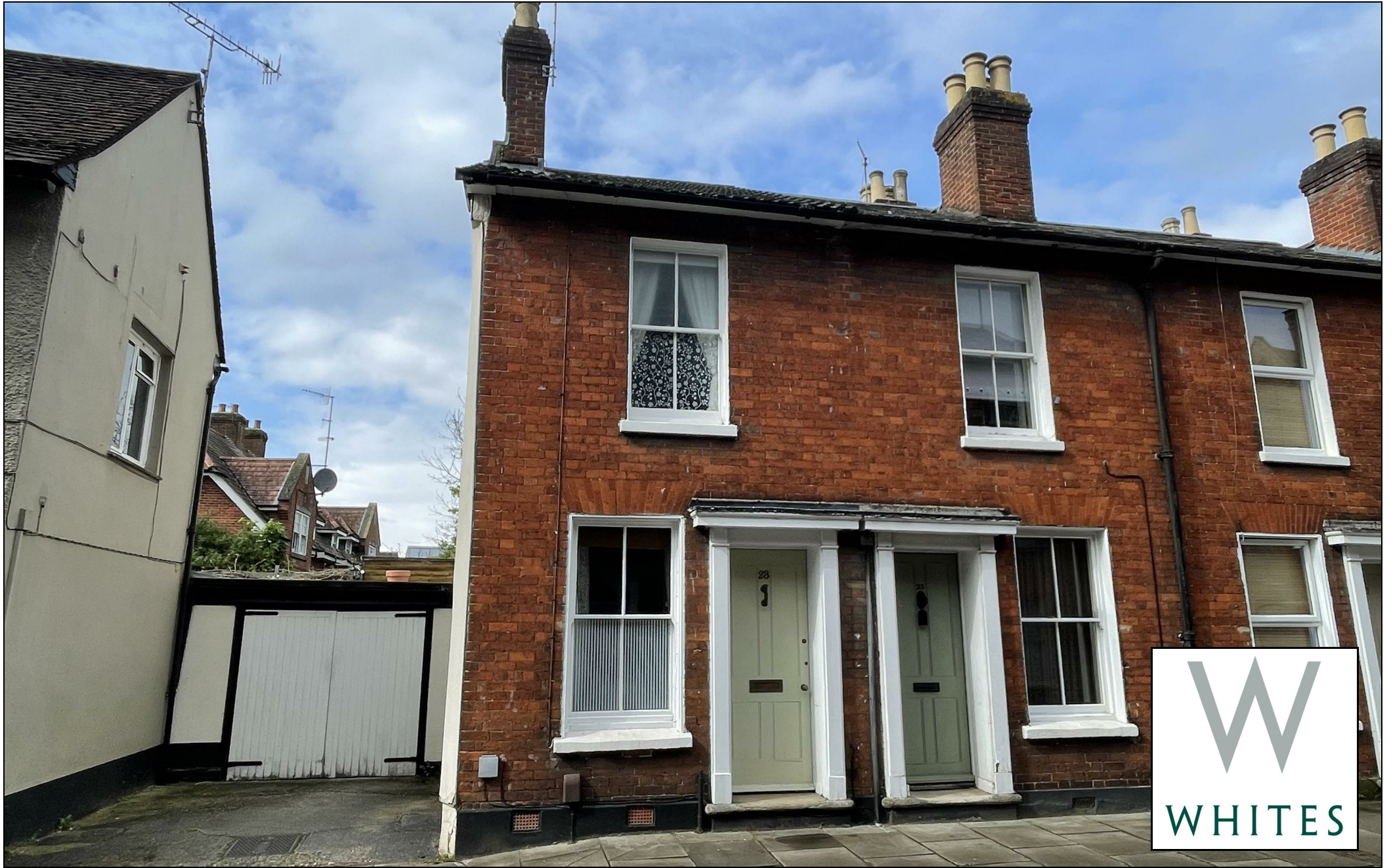
Painters Cottage, 23 Bedwin Street, Salisbury, Wiltshire, SP1 3UT